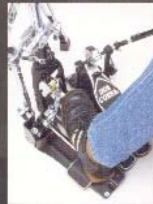
(B) Release the Hi-Hat