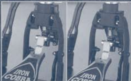
Plate Angle Adjustment

Footboard angles can be easily adjusted to any desired position.